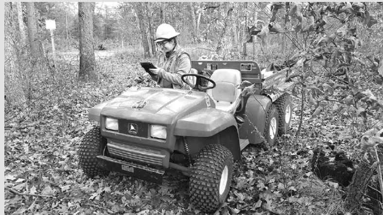
Many Department of Natural Resources staff members have been involved with the comprehensive state forest road inventory and mapping process, which is helping the DNR determine which of these roads will be open or closed to ORV use.

The public can view specific locations of proposed changes by using the interactive web map or by viewing printable maps available at michigan.gov/forestroads .