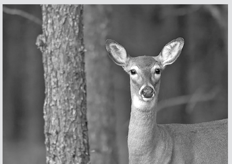
It is easy for hunters to get a button buck like this mixed up with an adult doe.

* Shoot with good visibility. Poor light and heavy cover make it difficult to determine sex and age.